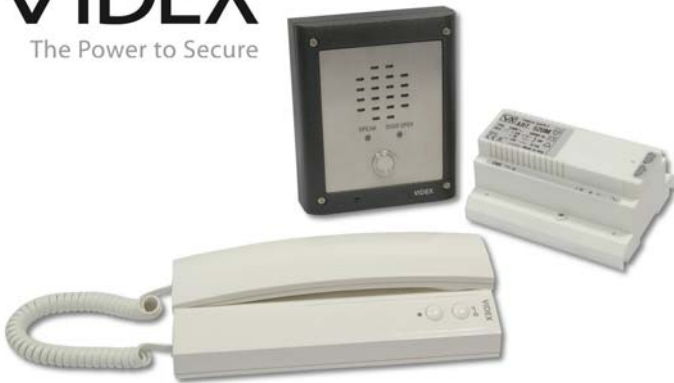
One Button audio kit