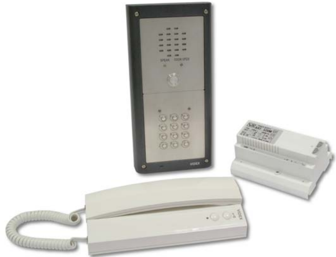
One Button plus keypad audio kit