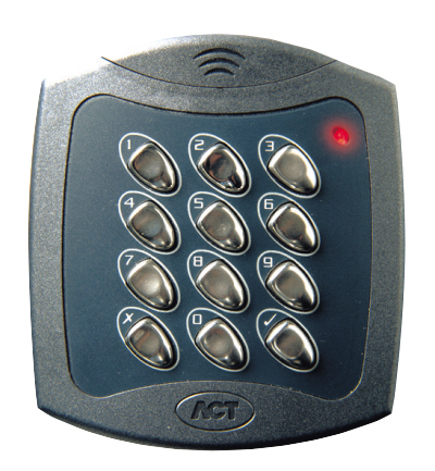
ACT 5 Digital Keypad