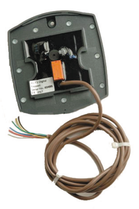
ACT 5 Digital Keypad with Lead (3m)