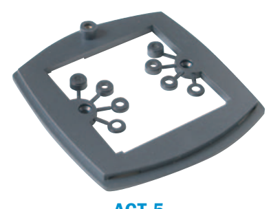
ACT 5 Flush mount plate